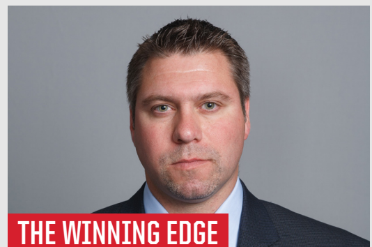
THE WINNING EDGE

To elevate Northeastern to the top echelon of men's intercollegiate ice hockey, the program must have national name recognition. To achieve this, the team must strengthen its home schedule by playing nationally ranked, non-conference opponents such as Notre Dame, Minnesota, and Minnesota Duluth. Home games against quality tournament opponents are important for recognition purposes, a factor in the PairWise rankings that determine NCAA Tournament